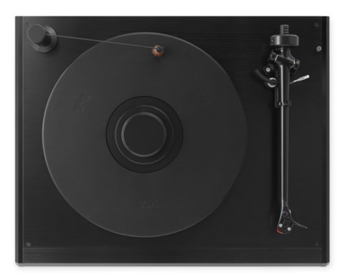
G 2000 R with modified Rega tone arm