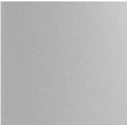
Arctic silver 96