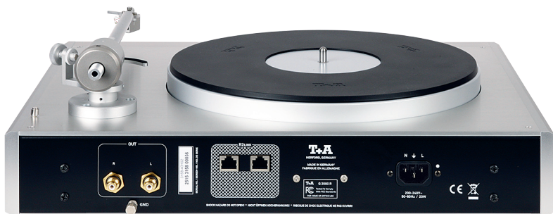
ABOVE: At the rear of the unit are output phono sockets and a grounding post, plus an IEC AC mains connector. The two RJ45 sockets are for remote control link to a T+A amplifier, and not an Internet connection for you to upload your LPs to YouTube...

On more than one occasion, a softly played background instrument proved more evident than I was accustomed to, avoiding any sense of just a few main instruments playing with others forgotten behind. Rather, each piece of music was a beautifully cohesive whole.